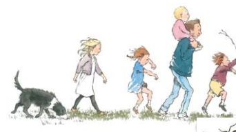
We're Going on a Bear Hunt

After the holidays we will begin to look for signs of Spring . We will also be looking at the books: Handa's Surprise and Lulu gets a Cat .